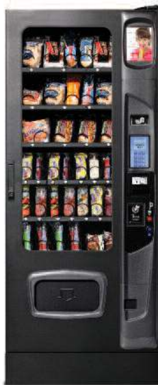
Shown in black with iCart touch screen, delivery assist and kick panel options.