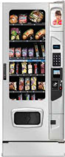
Shown with silver door and kick panel options.