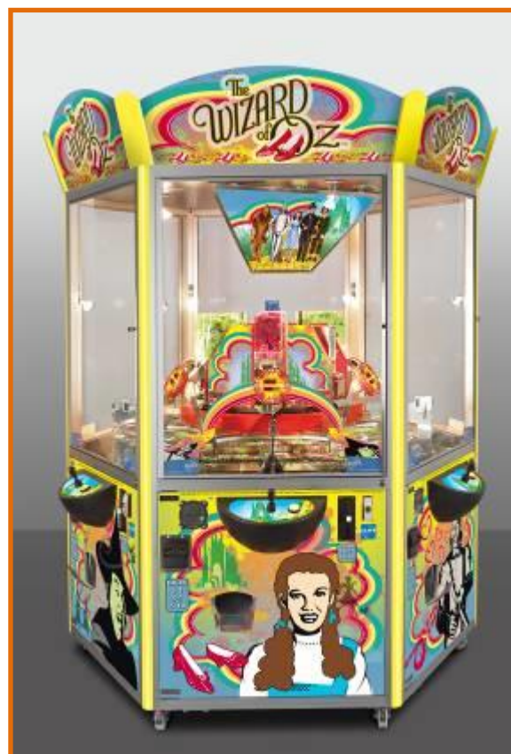
The Wizard of Oz