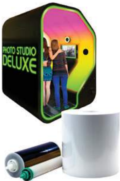
PHOTO STUDIO DELUXE

Our parts and service team offers consumable items that every location should have. These are items that needed in the everyday operation of equipment. Make sure customers are amply stocked on parts to eliminate downtime and prevent next day air shipping charges as well as keep the customers in the game!