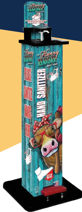
COMPLETE CUSTOM GRAPHICS