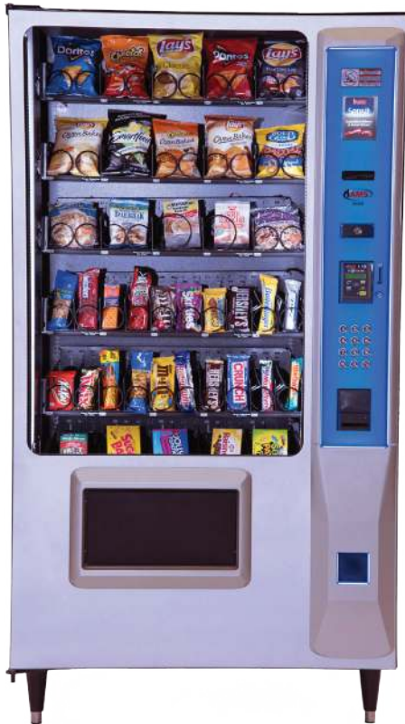
Epic Premium shown with Champagne Trim, Blue Dashboard and Cool White Lighting