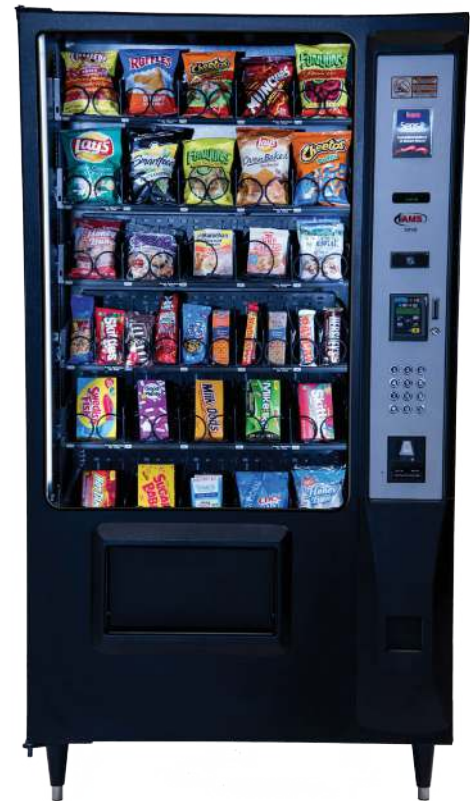
Epic shown with Black Texture Trim and Silver Dashboard