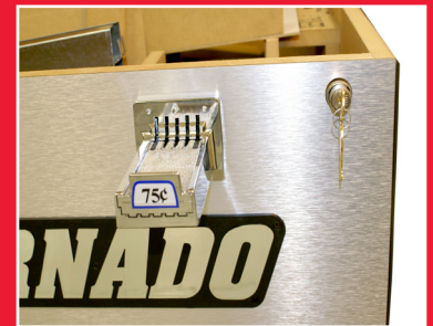
Positive and reliable 9-ball drop

Tornado Coin Foosball has patented features and a tournament-tough cabinet designed for superior play, ease of maintenance and a long service life. Enjoyed by players and operators!