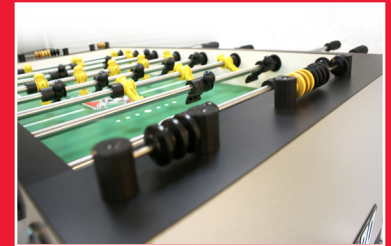
Goal and match counters as used in tournament play